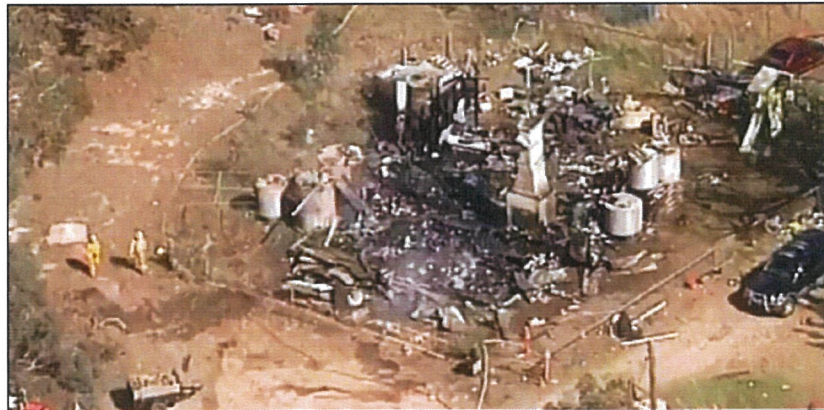
Aerial image sourced from media (presumably taken 15.4.2018)